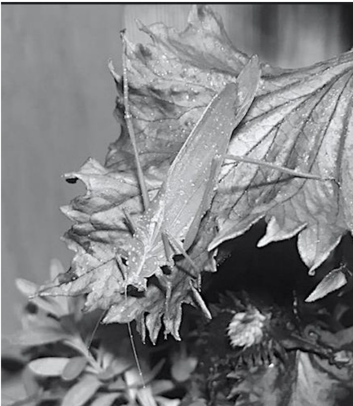
Broad winged bush katydid