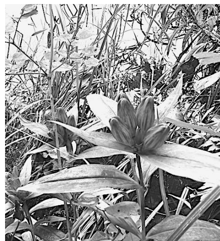
Closed gentian, Eastern River.

The natural world is always there for us. Constant and steady. There's so much to hear, see and wonder about. Step outside. Let us know what you observe!